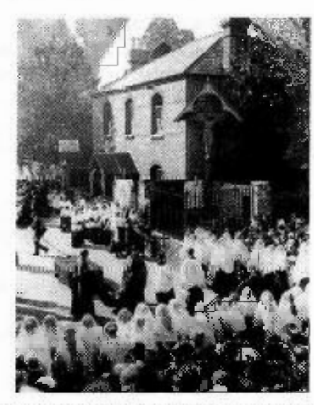
The inauguration of the Wayside Cross, at the corner of Gates St. and Upper North St. October 1919.

(Ed. Note: The above rang a bell, and I checked through my files. The picture below was found at the Clergy House in Pekin Street, and I am indebted to Father Bill for allowing me to make a copy of it. However, I do not appear to have used it in any of my publications!)