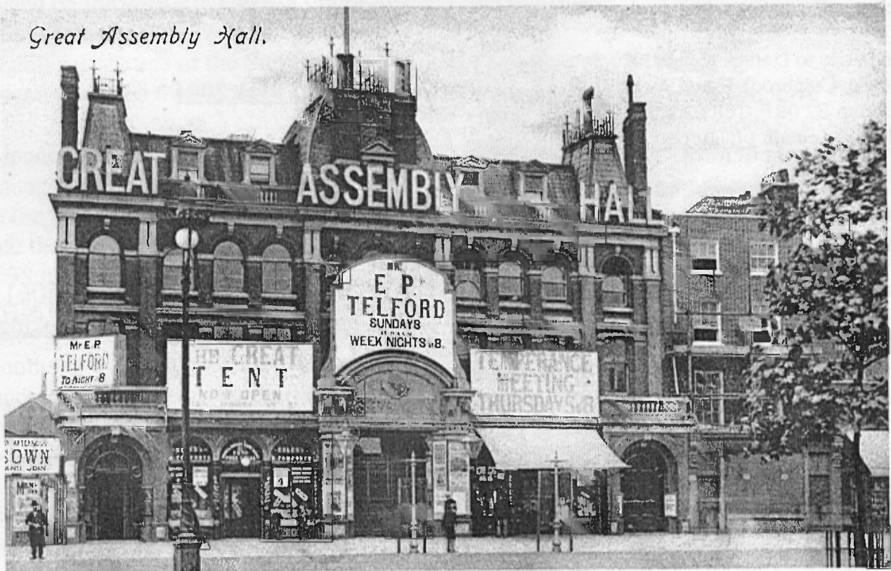
Great Assembly Hall.