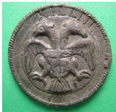
Supposed beggar's badge from Killin, Perthshire; serial no.78 below

So, they weren't all wholly plain and unadorned, as will be seen by the specimen on the right. Do I really believe that a rural Perthshire parish had 78 paupers simultaneously? Perhaps, like CTs and their serial numbers, there were various ways of doing it; each pauper having a unique number which was theirs for life, which saves possible ambiguity but re-